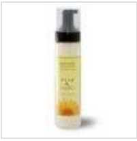
Jane Carter Solution : Wrap and Roll