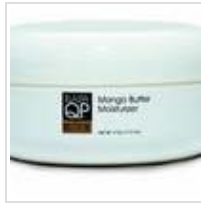
Mango Butter + Curlformers = Happy Dance!