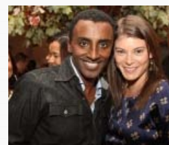
Red Rooster Friends & Fam Preview