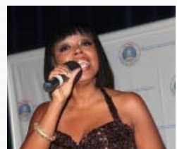
7th Annual Opening Doors Awards