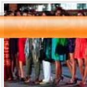
The UPTOWN Rundown 11/5