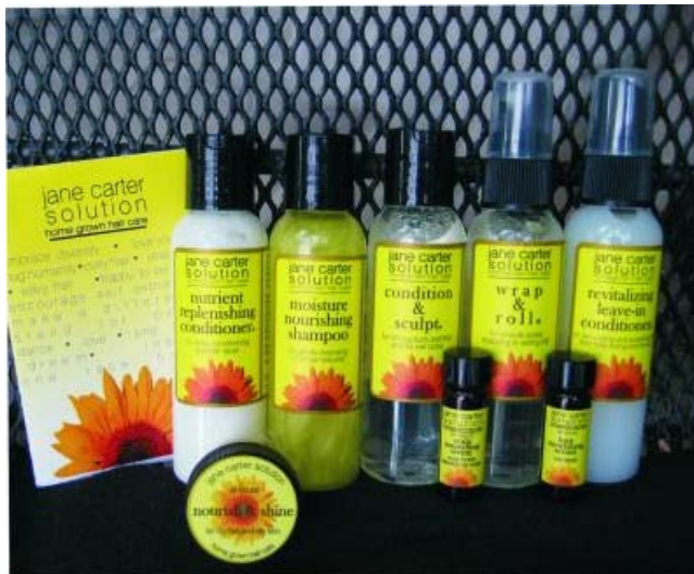
Jane Carter Solutions