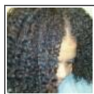
My natural hair care pampering session