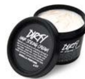
Dirty Hair Styling Cream $12.95 - Lush