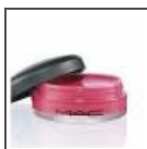
MAC Tinted Lip Conditioner