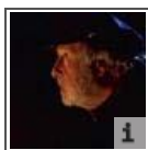
Top 10 Best Opening Sequences to Ghost Movies Xomba.com