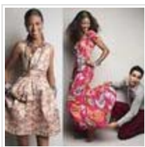
Countdown to Zac Posen for Target