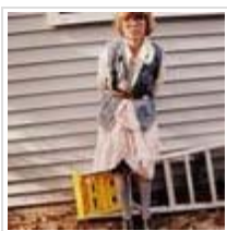
Video Glam: Teen Blogger Tavi Teams Up with Rodarte for ...