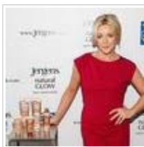
Jergens Skincare Teams Up With Jane Krakowski